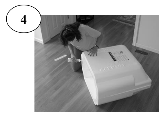
4) Snip end of adhesive tube with scissors and apply entire contents in a zig-zag pattern on the end of the top half.