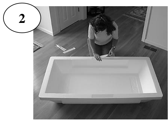
2) Apply tape to the flat surface as shown.