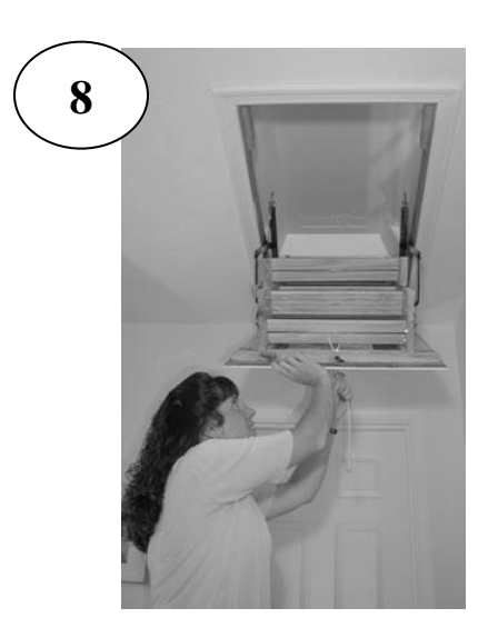
8) Place in attic over stair opening