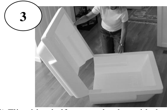
3) Flip either half onto each other with the tape acting as a hinge.