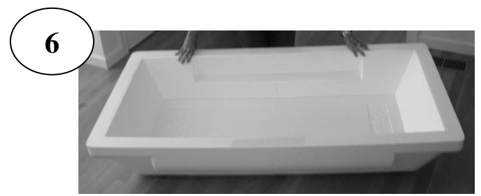
6) Squeeze Draft Cap together and then flip over.