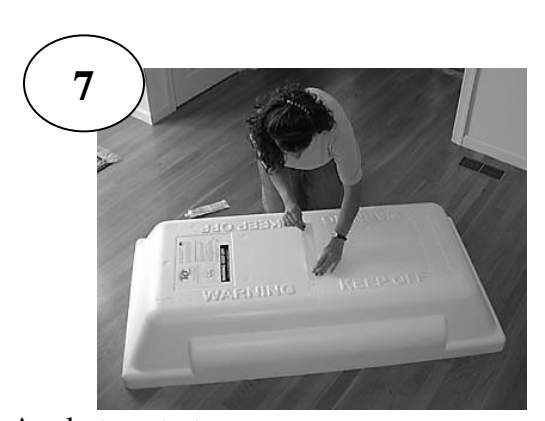
7) Apply tape to top seam.