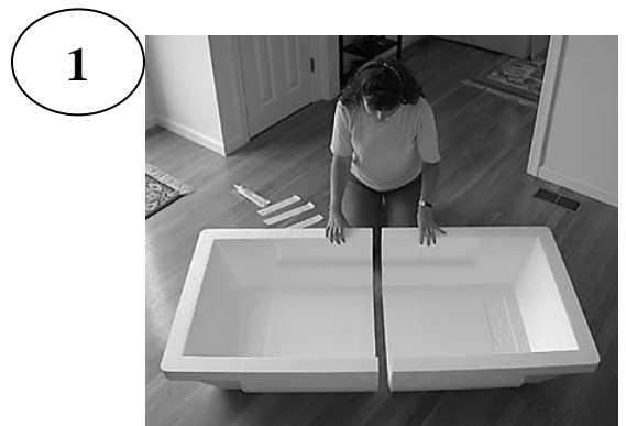
1) Lay Draft Cap upside down on flat, protected area. Align halves end to end, and align sides.